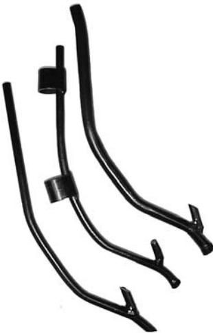
Left to right: AP-705021, AP-705023, AP-705024