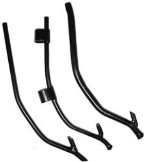
Left to right: AP-705021, AP-705023, AP-705024