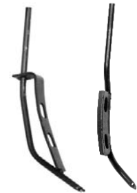
TA-1 & TA-2

Learn more about all of our standard chisel options in the ShieldAg Tillage Tools Catalog.