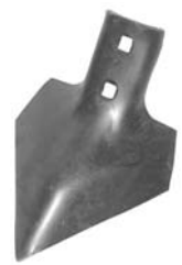
Chisel Plow Penetrator Sweeps