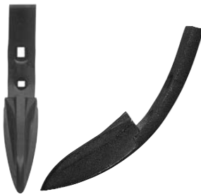
ShieldAg C34-SP Heavy Duty Spike