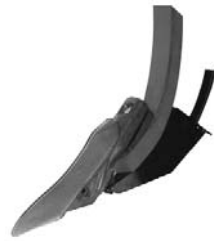
Acra-Plant Air Seeder Attachment