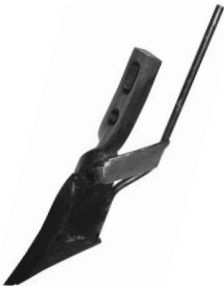
Heavy-Duty Chisel Plow Knife with Trash Guard