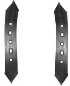
123HL & 123HR

Improve your heavy-duty chisel for “soil saver” operation by adding our heavy-duty chrome carbide point. See Section 7 of this catalog for details on all of the optional chrome carbide points available from Acra-Plant.