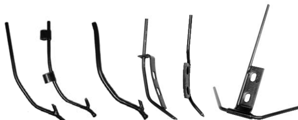
Widest Variety of Chisel Plow & Sweep Tubes on the Market