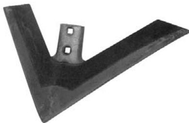
26" Conservation Sweeps