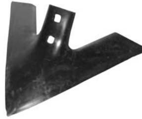
Heavy-Duty Chisel Plow Sweeps