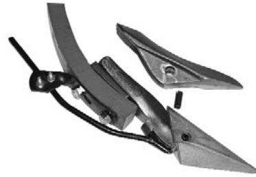
Acra-Plant Quick-Change Chisel Plow Point with Fertilizer Option